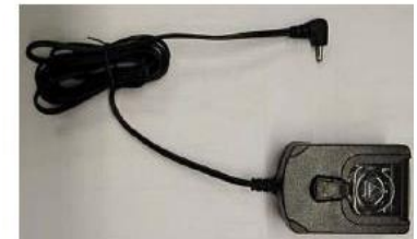
PWR-WUA5V4W0US Power Supply 5.2v, 1.1A